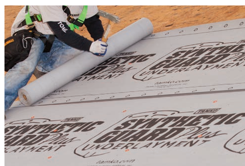
Synthetic Guard™ Plus Underlayment