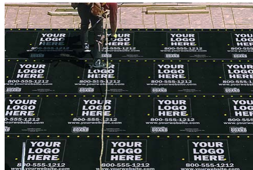
Synthetic Guard™ Underlayment